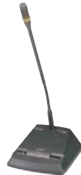
SX-D100A Delegate's Unit