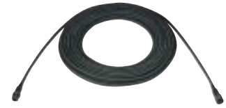
RK-1713 Connecting Cable