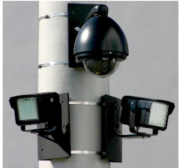
The EXPB-001 Performance Bundle delivers Even-Illumination active-infrared night vision performance, combining all required hard ware components into a turnkey, value-added solution kit. Designed and optimized to provide a horizontal field of night vision spanning 180ft across at a distance of 350ft.