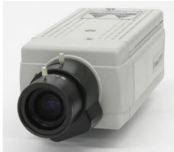
Above ↑: The FMX800 delivers 24/7 functionality. Mechanical Filter technology combined with an extended range LXR CCD ensures outstanding color performance during the day and excellent IR sensitivity at night.