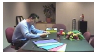
MFP Technology: The same scene shows excellent color performance under Extreme's mechanical filter technology.