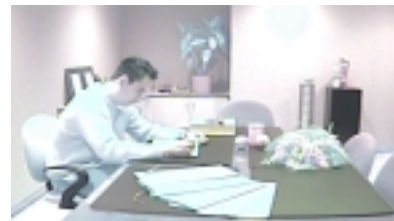
Conventional dual mode color / IR camera: Video taken without MFP technology suffers from IR bleed and poor quality color.