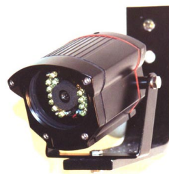
Left ←: EX26NX camera with U-bracket support.

Camera: EX27SX800 LXR Wall Bracket: EXMB.020 Infrared Illuminator: UF500