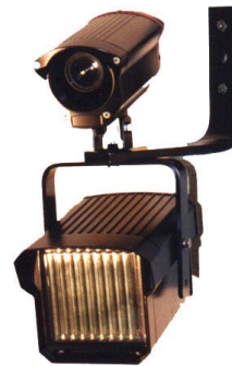
Left ←: EX27 camera / UF500 infrared over / under arrangement.

Camera: EX27SX800 LXR Wall Bracket: EXMB.020 Infrared Illuminator: UF500