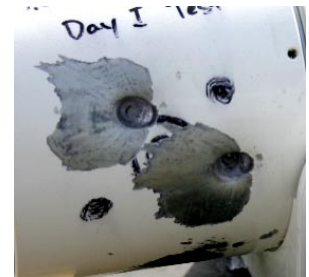
Above: High calibre 7.62mm and 5.56mm bullets do not penetrate the two layers of 1026 Cold Drawn High Strength steel.