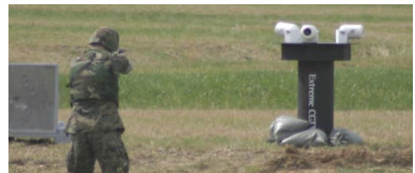
Testing at FPED 2005 at Marine Base Quantico in Virginia. The ZX20s delivered uninterrupted video surveillance in the face of US Marine gunfire attack.

Specifications are subject to change without notice